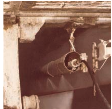
Electrically driven traverse beam with fan nozzles