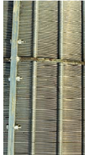
Cleaning results on a filter cleaned by high-pressure water jetting