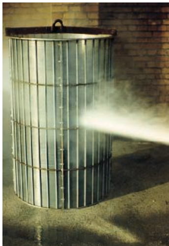
Filter cleaning using a high-pressure water jet