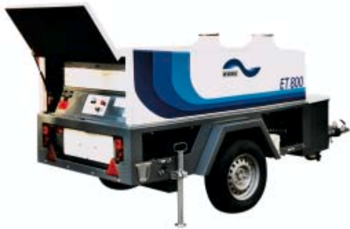
Hot waterjetting system Ecotherm® for efficient sieve cleaning