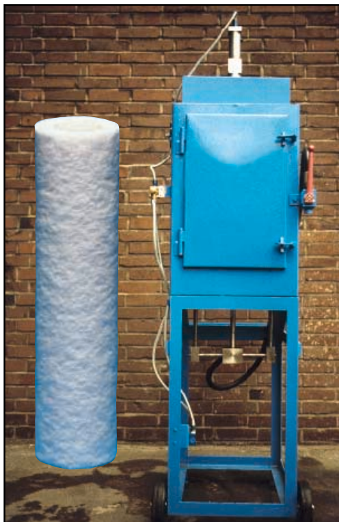
Cleaning of candle filters left: filter, right: water jet cleaning system