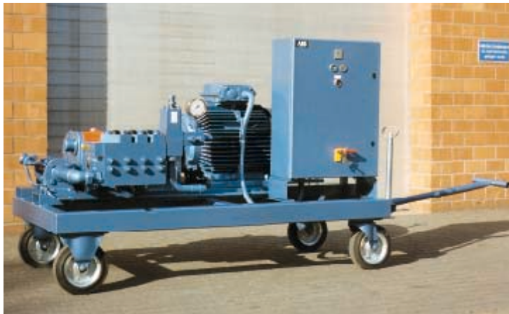
Mobile high-pressure cleaning system type 752