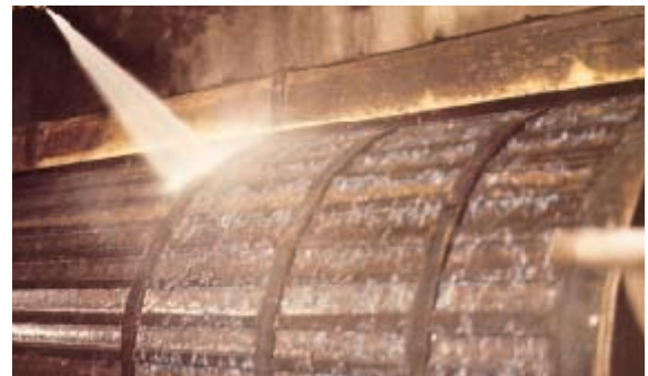
Cleaning of sieve-suction-rollers with high-pressure water lances